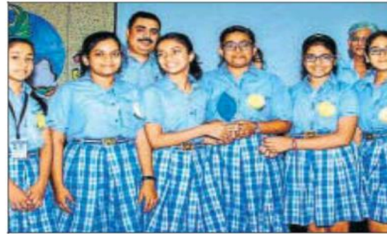
■ (Left) World Heritage Day was celebrated in JKG International School, Indirapuram, under British Council ISA activity. (Right) Winners of 'Harmonica-2018'- The World Earth Day Celebrations at Vishwa Bharati Public School, Noida.