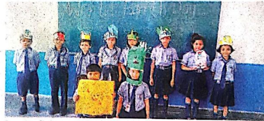
विशाल भारती पब्लिक स्कूल में आयोजित कार्यक्रम में उपस्थित बच्चे