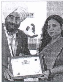
Indus Valley Public School, Noida, was ranked one of the best schools in a recent survey; (right) Vishwa Bharati Public School, Noida organised 'Harmonica' under the aegis of Ministry of Earth Sciences.