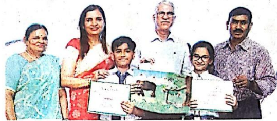
रोहिणी सेक्टर-5 स्थित माउंट आबु पब्लिक स्कूल में विश्व पृथ्वी दिवस पर आयोजित चित्रकला प्रतियोगिता में अबल आये छात्रों को सम्मानित करते अतिथि