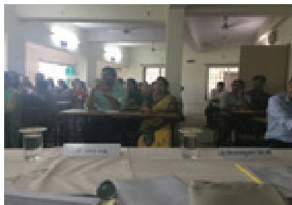
Sharada Script Learning workshop in Nagpur