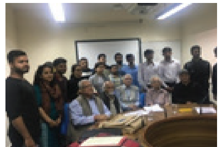
Sharada Script trained scholars