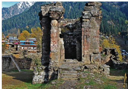
Sharada Temple Ruins Pakistan Occupied Kashmir