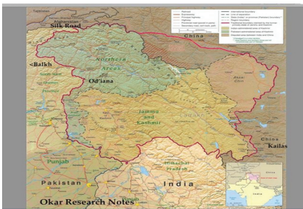
Ancient Kashmir Map