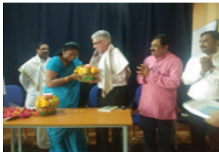
MOU Singing with KSU in 2018