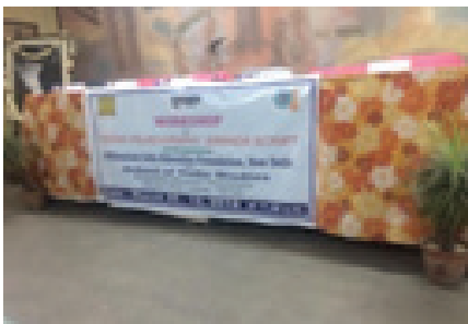
Sharada Script Learning workshop Banner