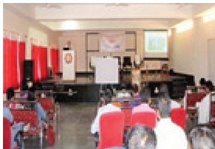
Sharada Script Learning Workshop