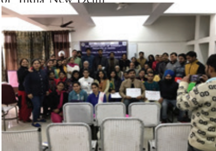
Certificate distribution at the end of Sharada Script Learning workshop