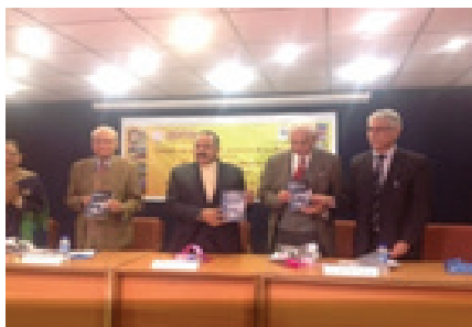
Release of Sharada Script Primer by Hon'ble MOS PMO Dr Jitender Singh