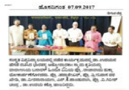
Press coverage after signing of MOU with KSU Bangalore